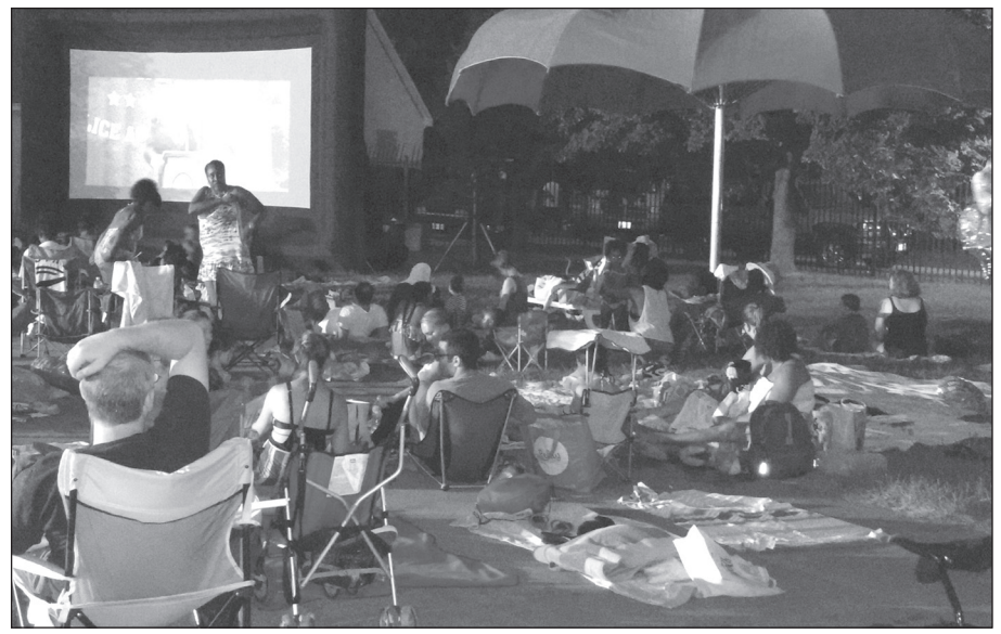
Family Movie Night sponsored by the Baltimore Police Dept and RNA.

At Our Next Meeting... Nominations and Elections for RNA Officers for twoyear terms. Come out and vote or volunteer for one of our committee positions