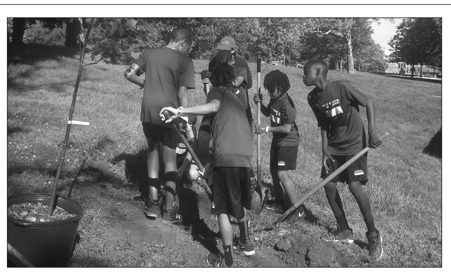
St Ignatius Students Help Plant New Trees and Keep the Park Clean. Thanks guys.

community yard sales that can always use volunteers. lf you are interested in helping out or would like more information --email me at rnabaltimore@ gmail.com or attend our monthly RNA meetings. This month's is on Monday, May 22, 2017.