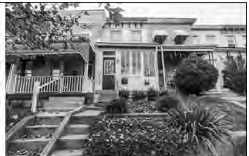
3504 Hickory Ave, Hampden $179,900 2Bed/1Bath

Serving all of Baltimore and surrounding counties. How can we help you with your Real Estate needs?