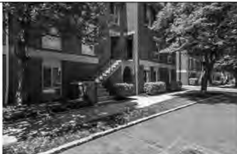
534 S. Charles St, Otterbein $224,900 2Bed/2Bath