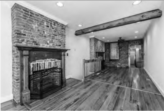
New Listing in Historic Federal Hill 1244 Riverside Ave

Special thanks to the Webelos and Wolves of Cub Scout Pack 577 who came out in December for a couple service projects in Riverside park. The Webelos were tasked with filling in holes left from old trees, dog activity, and park traffic. As a group, they moved eight loads of topsoil and filled in about a dozen locations. On the following weekend, the Wolves arrived with rakes in hand to tackle some of the leaves collecting in the gutter along Covington. They were able to fill 20 bags and cleared most of the area near the storm drain by the Covington/Heath entrance. Overall, the kids did a great job and we hope to have them back in the near future.