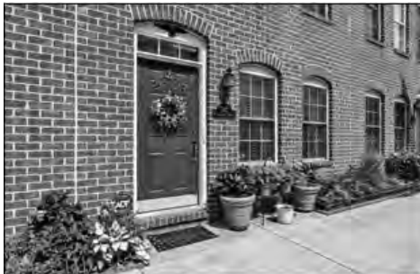
1312 Richardson St, Locust Point $459,000 3Bed/3.5Bath