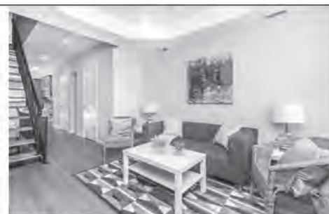
1435 Haubert St, Locust Point $289,900 2Bed/3.5Bath

Serving all of Baltimore and surrounding counties. How can we help you with your Real Estate needs?