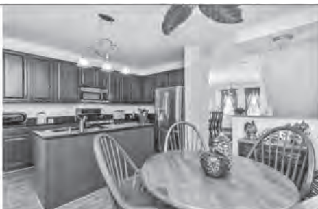
1312 Richardson St, Locust Point $459,000 3Bed/3.5Bath