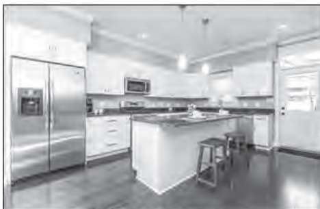
2633 Fait Ave, Canton $489,900 3Bed/3Bath