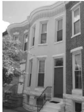
419 E Fort Ave