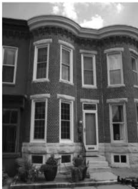
1703 Belt St