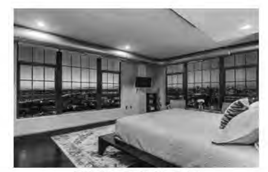
1200 Steuart St, Silo Point $899,000 2Bed/2.5Bath