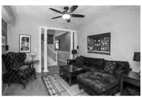
1631 S. Charles, Federal Hill $339,000 2Bed/3Bath