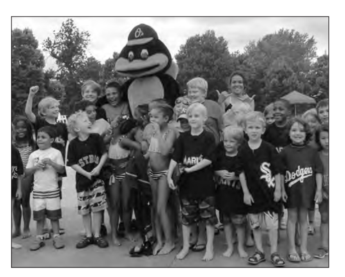
South Baltimore Little Leaguers celebrate the season at Riverside Pool on June 7th.

The Charm City Circulator's Banner Route enhances the quality of life for Riverside residents. It is critical to connecting our neighborhood to other parts of the city so we can enjoy all we love