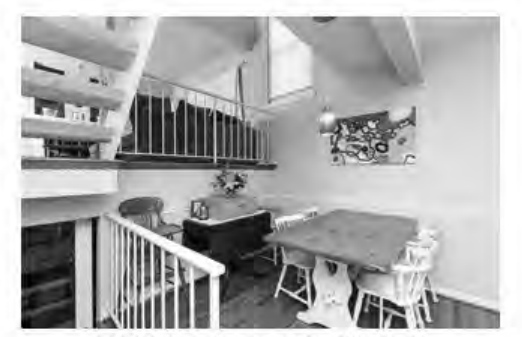
102 W. Montgomery St, Otterbein $359,900 3Bed/2Bath