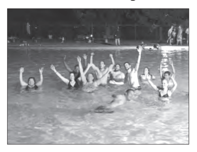
Friday, June 26th 8-11pm

Adults only - $5/person, $7 if you bring a cooler. Join RNA for a fun evening swimming under the stars.