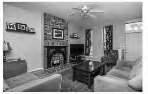
108 W. Clement, Federal Hill $309,000 3Bed/3Bath