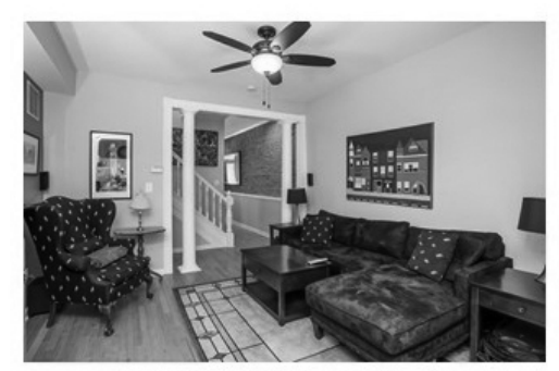
1631 S. Charles St, Federal Hill $339,000 2Bed/3Bath