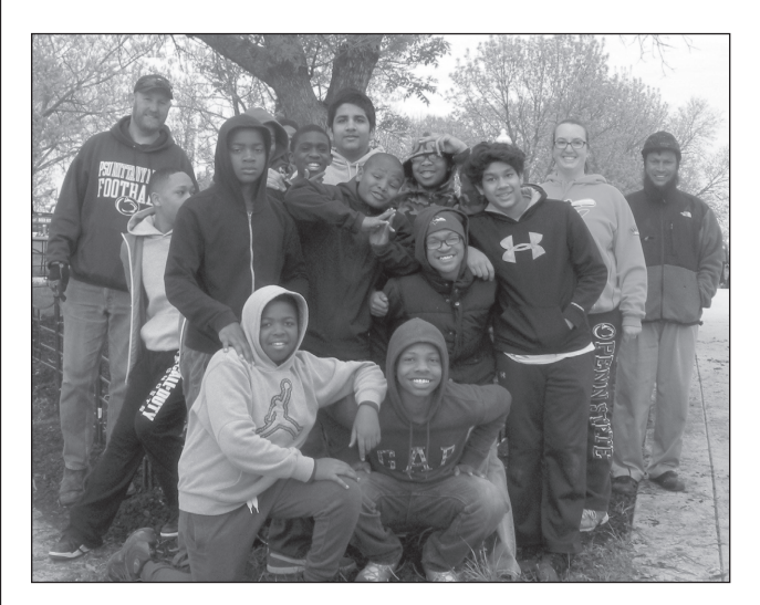
Many thanks to several students from St. Ignatius who helped to improve the garden at the Johnson/Heath park entrance during the Mayor's Spring Clean-up!

If you do not follow us on Facebook or are not in the RNA Neighbor Connect Facebook group, you may have missed some discussion answering important questions raised by residents. When asked if RNA had to approve these spots, we did not. Zipcar determines locations that they believe to be favorable for residents in need of their services, and makes all arrangements with Baltimore City. With regards to the exact placement of the spaces, RNA was able to give an opinion, but did not have