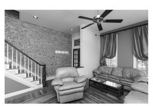
1526 S. Charles St, Federal Hill $369,000 3Bed/2.5Bath