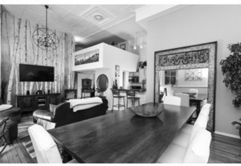
112 E. West St Unit 201, Federal Hill $369,000 2Bed/2Bath