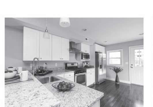
131 W Randall St, Federal Hill $269,900 2Bed/2Bath