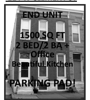
LISTED FOR $314,900