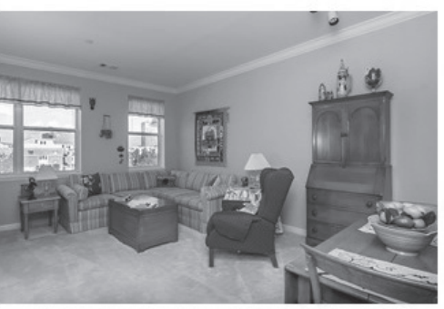
23 Pierside Dr #305, Pierside at Harborview $209,900 1Bed/1Bath