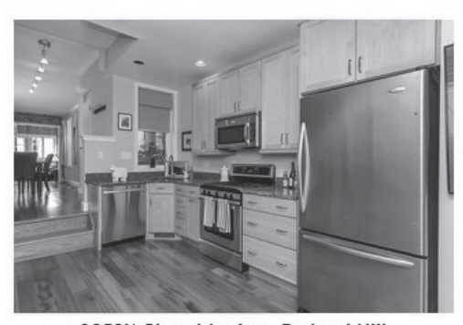
12521/2 Riverside Ave, Federal Hill $364,900 3Bed/2Bath