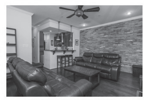
1328 Decatur St. Locust Point $495,000 4Bed/3.5Bath