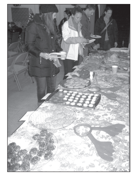
Last Year's Cookie Contest was fun, festive and flavorful