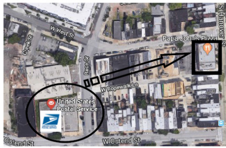
The South Baltimore USPS will be moving on February 4, 2019 from the corner of W. Ostend and Race Street to the corner of S. Hanover and W. West Street.