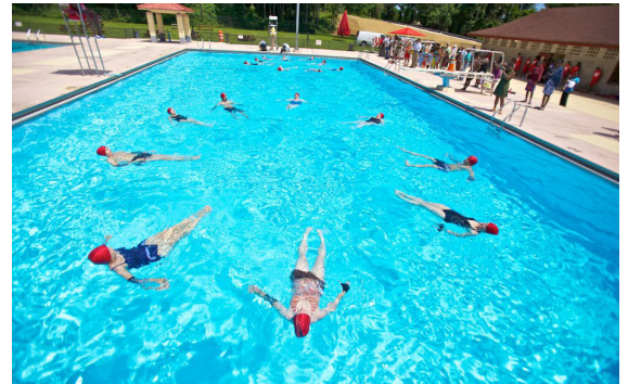
Fluid Movement members at BCRP Big Splash Event.

Visit FLUIDMOVEMENT.ORG for more information, tickets, and sponsorship opportunities!