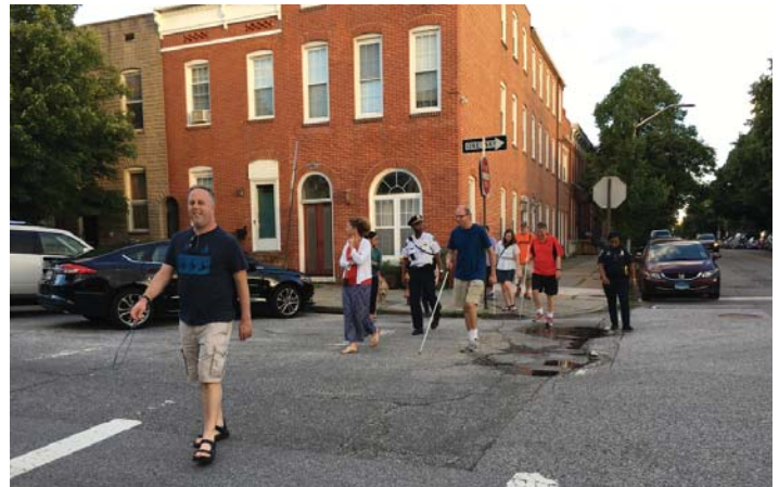
LEFT: Cross Street Market Renovation Work ABOVE: RNA Public Safety Walk