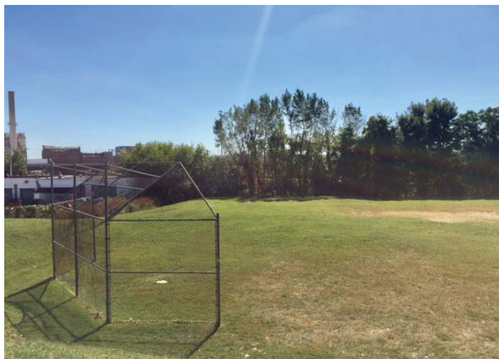
ABOVE: Conceptual plan for field renovation. LEFT & BELOW: Current playing fields