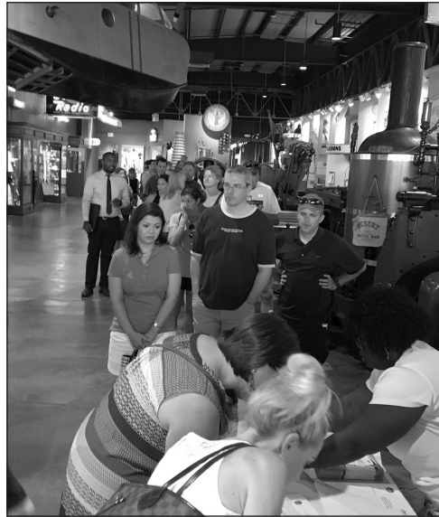
Neighbors wait to check in for Banner Route meeting