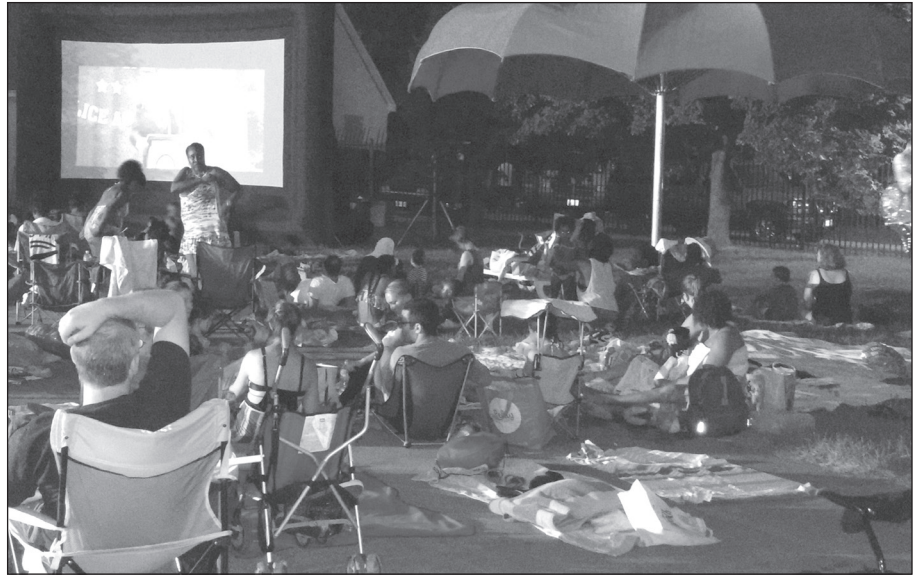
Family Movie Night sponsored by the Baltimore Police Dept and RNA.

At Our Next Meeting... Nominations and Elections for RNA Officers for two- year terms. Come out and vote or volunteer for one of our committee positions