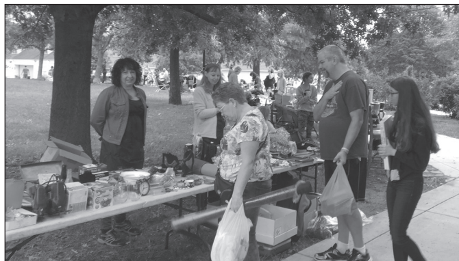
Pickers at the Fall Yard Sale

Despite the threat of rain, Mother Nature could not stop the October 8th Riverside Neighborhood Association community yard sale from being a