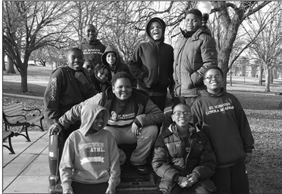
Students from St. Ignatius Loyola Academy volunteer to rake and bag leaves in Riverside Park. Thanks guys!