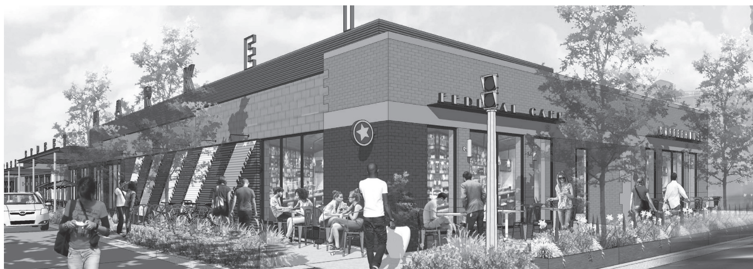
A rendering of the plans for a renovated Cross Street Market.

Cookie Contest is on Monday, December 12. Details on page 4