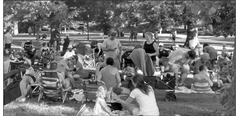
The High and Wides fill the park with music on August 13. Next concert - Sept 10