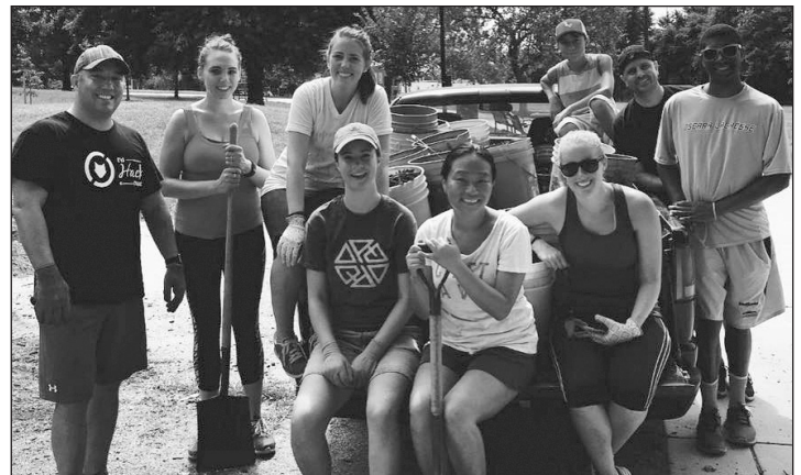
Friendly Folks from ZeroFox