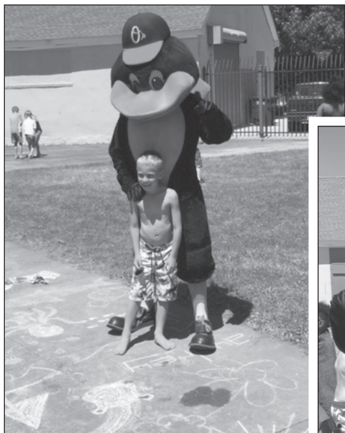
The Oriole Bird came to South Baltimore Little League Day at the Riverside Pool