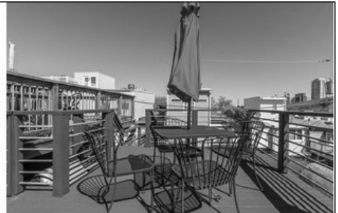
426 E. Clement St, Federal Hill 2Bed/2Bath

Serving all of Baltimore and surrounding counties. How can we help you with your Real Estate needs?