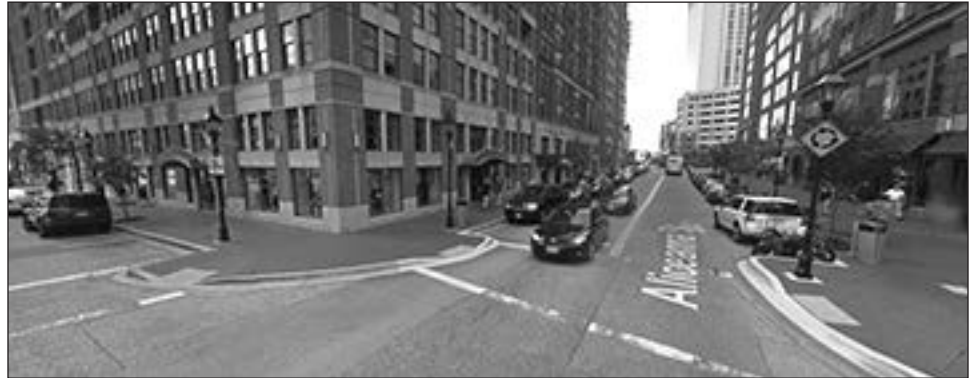
Example of curb extensions in Harbor East