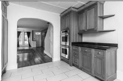
1710 Belt St, Federal Hill $264,900 2Bed/2Bath