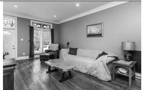
1618 Webster St, Federal Hill $340,000 3Bed/2.5Bath