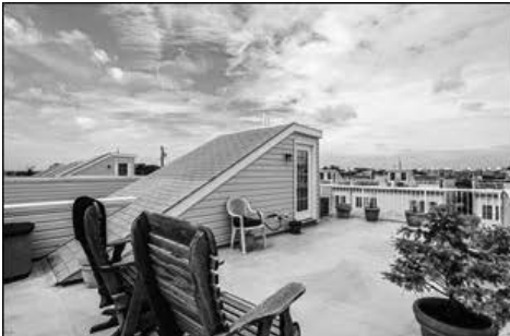
1312 Richardson St, Locust Point $459,000 3Bed/3.5Bath