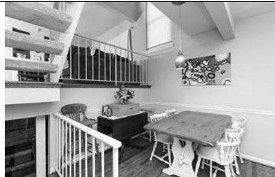
102 W. Montgomery St, Otterbein $359,900 3Bed/2Bath