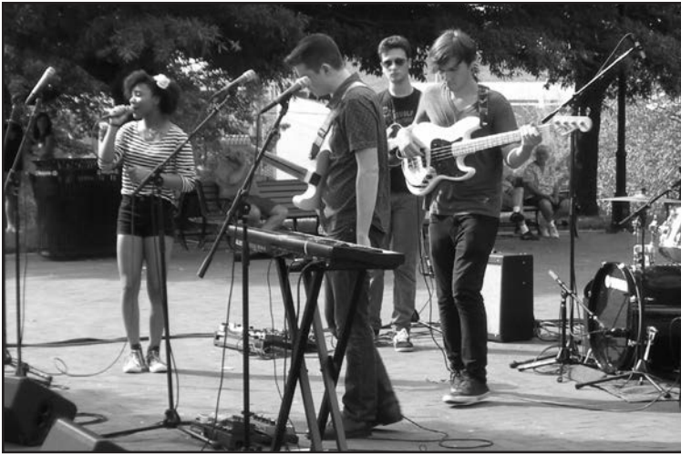
Summer Jams in July School of Rock showed a lot of range, playing tunes from the Jackson 5 to Pink Floyd at the gazebo on July 12th.