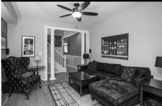
1631 S. Charles, Federal Hill $339,000 2Bed/3Bath