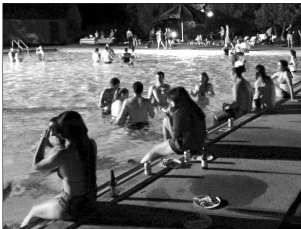
June 26th Twilight Swim

Adults only - $5/person, $7 if you bring a cooler. No glass allowed. Join RNA for a fun evening swimming under the stars.