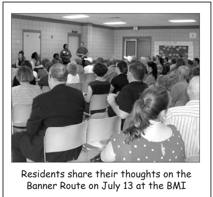
Residents share their thoughts on the Banner Route on July 13 at the BMI

Riverside Concert Series: Joy Classic & Heavy Lights, 5pm