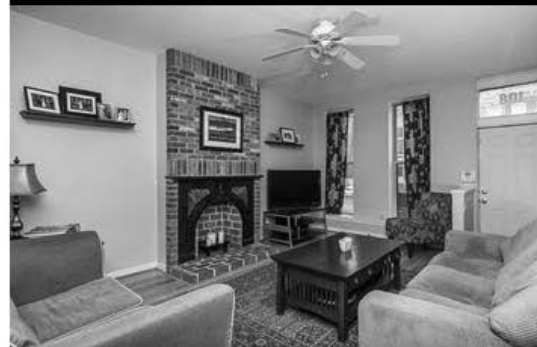
108 W. Clement, Federal Hill $299,000 3Bed/3Bath