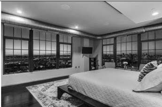
1200 Steuart St, Silo Point $860,000 2Bed/2.5Bath