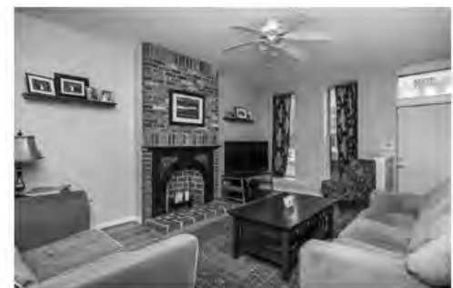
108 W. Clement, Federal Hill $309,000 3Bed/3Bath