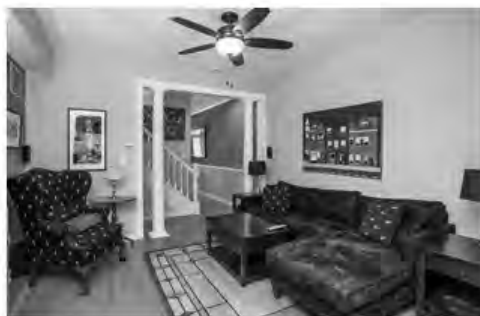
1631 S. Charles, Federal Hill $339,000 2Bed/3Bath