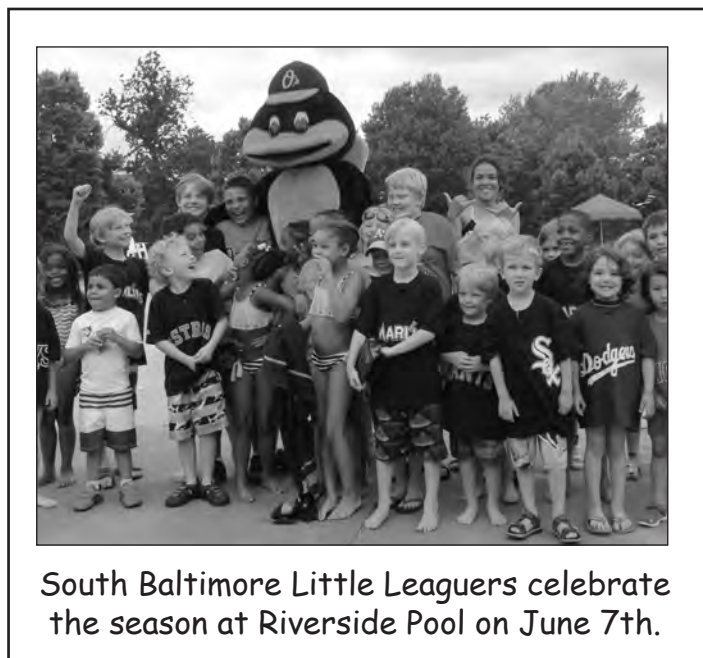
South Baltimore Little Leaguers celebrate the season at Riverside Pool on June 7th.