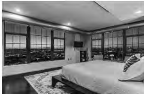
1200 Steuart St, Silo Point $899,000 2Bed/2.5Bath