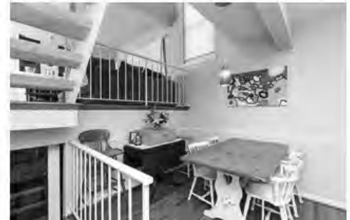
102 W. Montgomery St, Otterbein $359,900 3Bed/2Bath