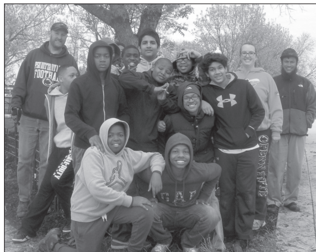
Many thanks to several students from St. Ignatius who helped to improve the garden at the Johnson/Heath park entrance during the Mayor's Spring Clean-up!

a bit to allow for a full parking space or two between the Zipcars and the stop sign. Thank you for your patience while we work with Zipcar to make this change.