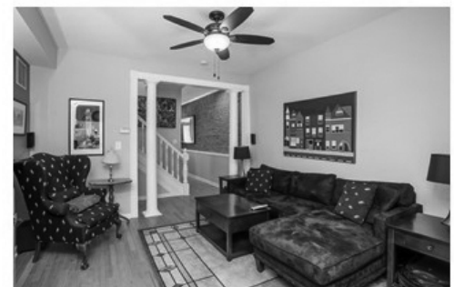
1631 S. Charles St, Federal Hill $339,000 2Bed/3Bath