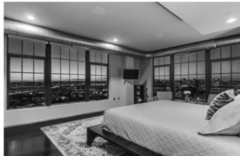
1200 Stuart St, Silo Point $929,900 3Bed/2.5Bath