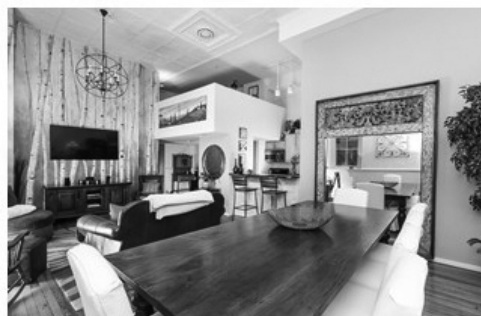
112 E. West St Unit 201, Federal Hill $369,000 2Bed/2Bath