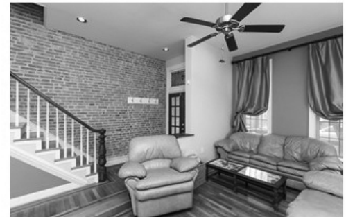
1526 S. Charles St, Federal Hill $369,000 3Bed/2.5Bath