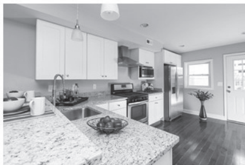
131 W Randall St, Federal Hill $269,900 2Bed/2Bath