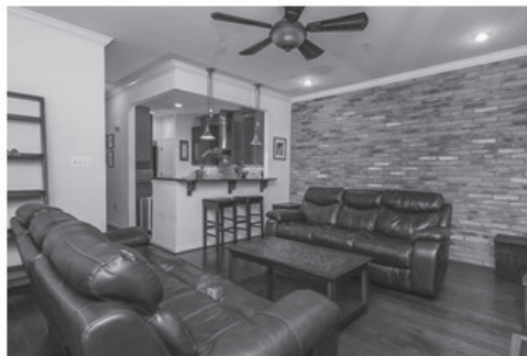
1328 Decatur St, Locust Point $495,000 4Bed/3.5Bath