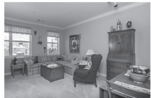
23 Pierside Dr #305, Pierside at Harborview $209,900 1Bed/1Bath