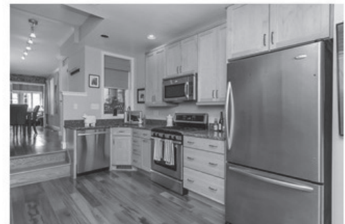
1252 1/2 Riverside Ave, Federal Hill $364,900 3Bed/2Bath