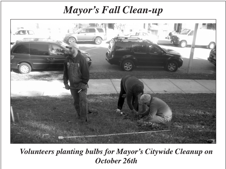
Mayor's Fall Clean-up