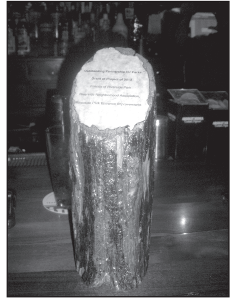
Our award for "Outstanding Partnership for Parks"

Now that the weather is cooling down, it's street tree planting time. If you have a request into the City's Forestry Dept for street tree work, this is the time of year when most of that activity takes place. The city cuts new pits, removes stumps, and plants new trees primarily during the winter months. If you have an empty pit, stump, or would like a new tree, send me a message ( jkf42@yahoo.com ) and I will put together a combined neighborhood list.