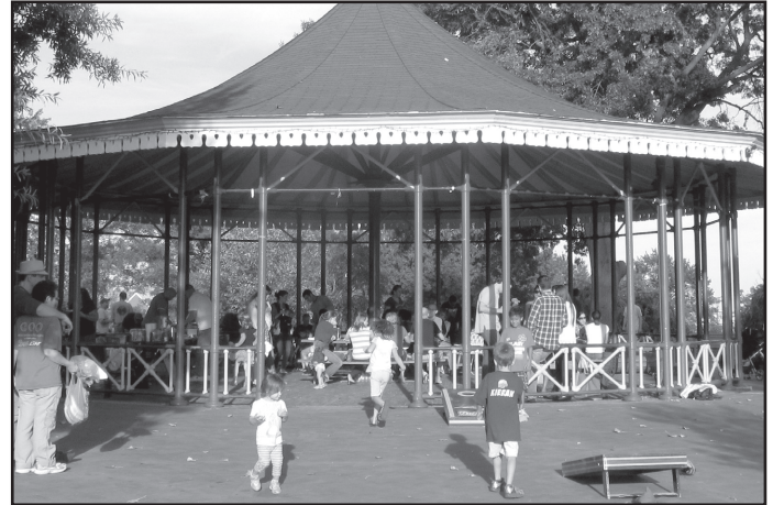
A fun time was had by all at the Sept 15th neighborhood social!

The Bozzuto Group and Solstice Partners presented their plans for the GE site to the Locust Point Neighborhood Association. This is the very large site on the corner of Fort and Lawrence which is within Locust Point's boundaries. The project is a mixed use plan with 270 apartments and retail on the first floor. The apartments will be a mix of studio, one, and two bedrooms. This plan meets the guidelines of the Key Highway South URP. The design creates significant step-backs to create less immense feeling to the structure. The design also has an open plan that will have a pedestrian friendly feeling, including retail/restaurants on the ground floor. The current plan will have 1.25 spaces per unit with added spaces for retail as well as accessory parking. For those who saw images of the design in the press, those were created solely to represent massing, setbacks, etc. and not materials that will be used on the project. Materials have not been finalized as of press time. The developer has taken steps that more than meet the URP. It is an enormous site that could have a much more massive and imposing presence on that corner. By putting step backs at 20 feet rather than the required 60 feet, the