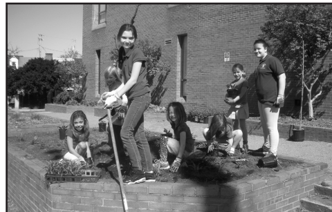
Students Planting at Thomas Johnson

Typically, the school funds the annual spring planting by hosting a plant sale. This year, the school received $913 from the Parks and People Neighborhood